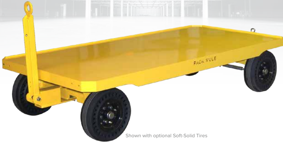
Shown with optional Soft-Solid Tires