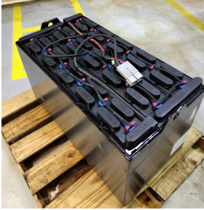
Before and after going through our mobile wash bay